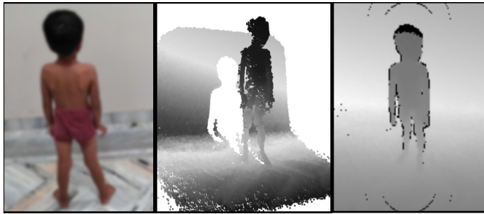
Fig. 1. (from left to right) (a) Back video of a child. (b) Point cloud data. (c) Depth image.