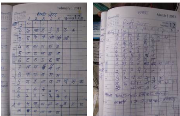
Figure 3. Native text input learning sheet prepared independently, with phone keys mapped to the Hindi alphabet