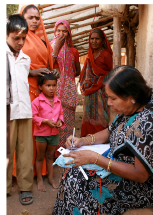
Figure 1. A Community Nutrition Educator (CNE) records child health information on paper forms in a village in rural Madhya Pradesh, India.

Networked digital devices such as mobile phones, personal digital assistants (PDAs), tablets and laptops are increasingly being used for improving the efficiency and effectiveness of data collection, as these technologies allow single-point digitization and efficient aggregation of data. Several initiatives in the past two decades have used PDAs for primary data collection in the developing world [1, 3, 10, 13, 14, 15, 23, 29]. Most recent innovations in data collection in the developing world have moved from PDAs to smartphones [8, 16]. However, even though the cost of smartphones is rapidly falling, they remain too expensive for many applications. In contrast, about 60% of the nearly 5 billion existing mobile phone subscribers live in developing countries [17, 20], and most of these subscribers own low-cost phones. There is an opportunity to use these low-cost phones for data collection in the field where resources are most acutely constrained.