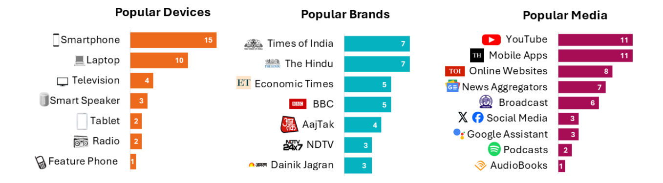
Figure 1: Popular devices, publishing brands, and media among our participants.

less cluttered (than on iPhone). There's more space and it just feels nicer to scroll through articles." (P2)